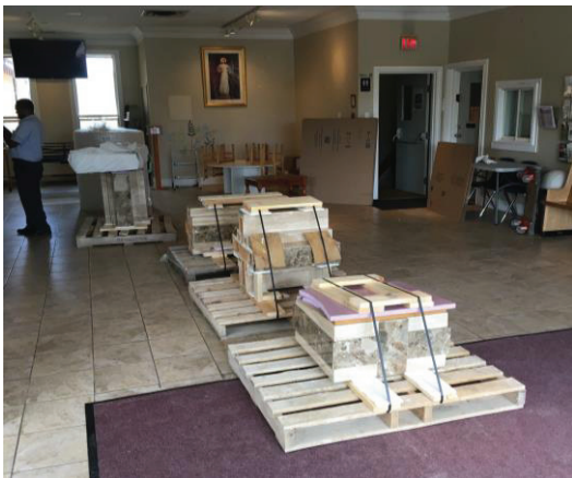
Removal of Marble from the Sanctuary